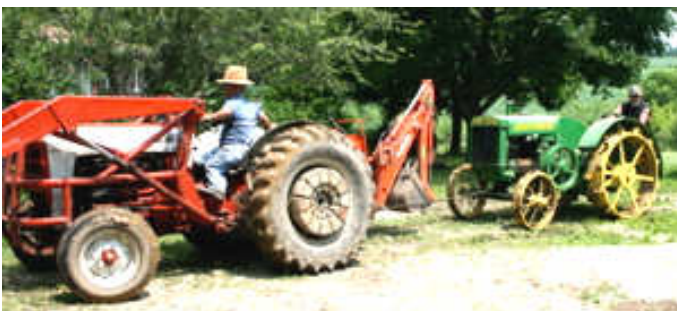
1925 Spoker D being hauled out from storage under cover. It sold for $14000.

Over breakfast in Bob Evans restaurant, Tom announced he was taking us to an auction preview. The dispersal auction scheduled for Saturday was called by the executors of a deceased collector and featured not only complete tractors but also many parts. On arrival, the auctioneer's crew were setting up the sale. There was almost a complete set of John Deere lettered series tractors, from a 'Spoker D' to an R',