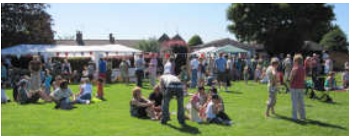
Enjoying a plated lunch on Massingham Green