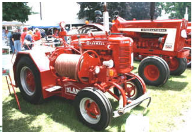
Genuine period Fire engine conversion fitted to Farmall A

Day 14 saw us leave the Indiana/Michigan border and head south-east, we had 250 miles to cover to reach Springfield Ohio. Enroute we dropped into Polk/McGrew tractor breakers at New Paris Indiana to browse the hundreds of tractors being broken, and buy parts.