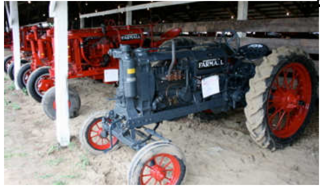
. Excellent turnout of early Farmalls

Also there was an experimental model 101 tool-carrier, and the 1930's party-piece of a John Deere D running whilst standing on 4 coke bottles! See below