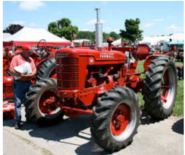
Symmetrical Farmhall A.