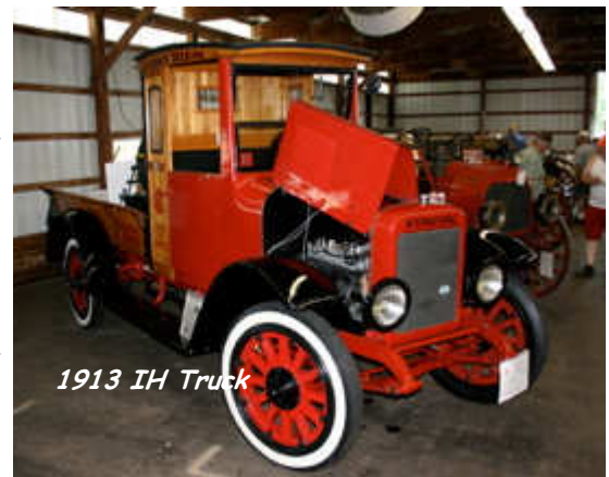
1913 IH Truck

The final full day of our US tour saw us head north to Wauseon Ohio for the National threshers association show. It was the last day of this four-day working steam rally that featured not only steamers but also a comprehensive display of early gas tractors. Steamers feature heavily at this show.