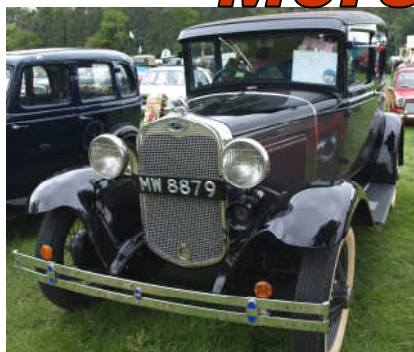
Best Classic Car: Noel Page