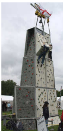
The Climbing Tower