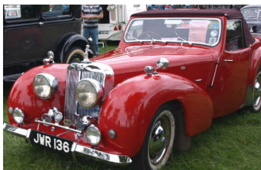
My dream Car: 1948 Triumph Roadster TR1 1800cc Completely resprayed + new mohair hood. The body is made from aluminium left over from production of WW2 fighter aircraft. Owner R. Thompson