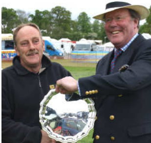
The Sir Jeremy & Lady Bagge Salver for the Best Bygone Exhibit went to J. Wakefield with display of hand-held implements.