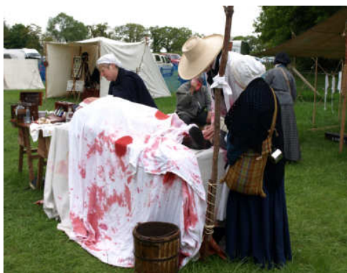
Any volunteers for a demonstration of a Leg amputation at the 13th Alabama Field Hospital?