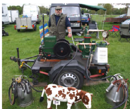
Ron Edwards 1932 Crossley 2.5hp vacuum pump running a Gascoigne & Simplex milking collector & clusters. It came out of a milking byre in Great Munden, seized up and was restored over the years.

Being a judge at a show is an onerous task and not one that many people would undertake. When the standard is high, how difficult it must be to select one winner. I tried to be selective with my picture taking, but still landed up with over 100 pictures! Below and on pages 3 and 4 are just a few. All the pictures I took can be emailed to you or printed to order and, very likely, they will appear on our club website in the near future. Viv