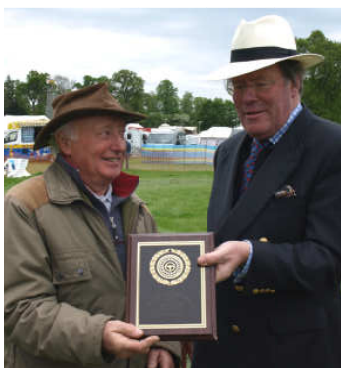
N. Page Best Classic Car 1930 Ford Tudor Model A