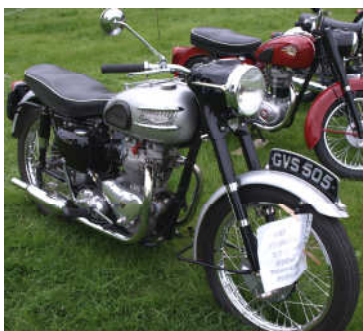
Best Motorcycle: B. Rudland