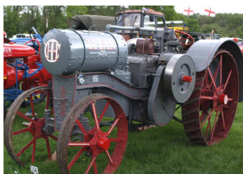
1916 Titan 1020 owner G. Carson 2 cylinders, 2 speeds. Titans were imported during WW1 to help with ploughing.