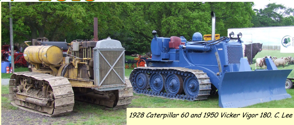
1928 Caterpillar 60 and 1950 Vicker Vigor 180. C. Lee

Well done to the organisers for continuing to hold a very informal and traditional rally that exhibitors and public still appear to want, as the numbers of exhibitors and public are growing to capacity for the available space. When other shows are disappearing, Woolpit looks to be growing. Well done and we look forward to next year. Oliver and Austin