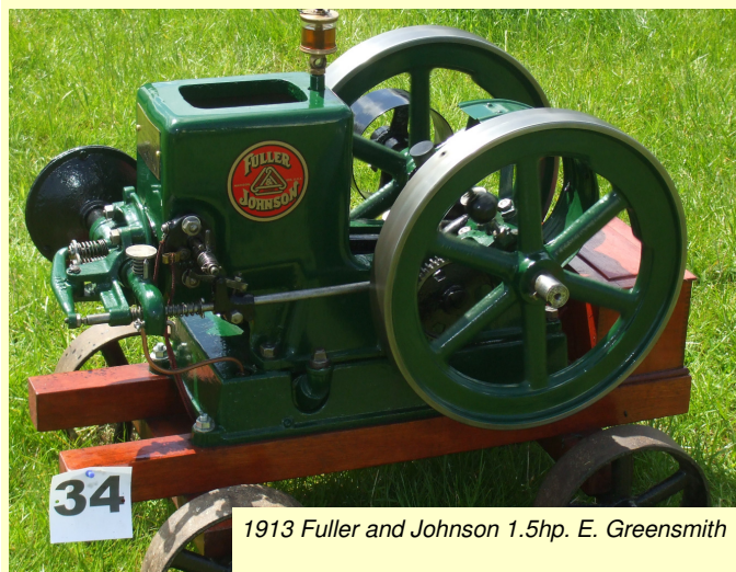
1913 Fuller and Johnson 1.5hp.