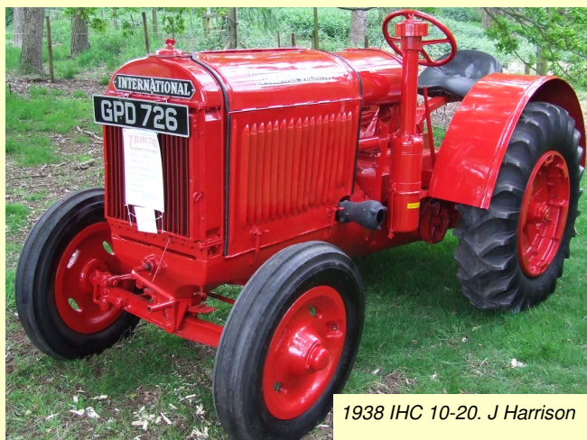
1938 IHC 10-20.