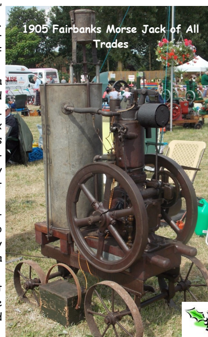
1905 Fairbanks Morse Jack of All Trades