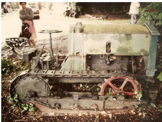
1939 Oliver 80 Standard, as purchased in 1996

Soon after this the opportunity arose to build a bungalow for ourselves, again on the private road we were living on. This took a long time and restoration had to take a back seat.