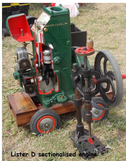
Lister D sectionalised engine