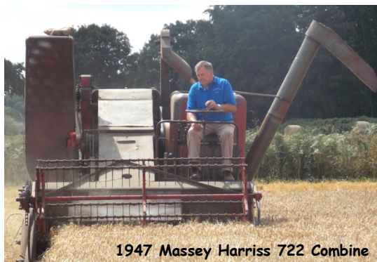
1947 Massey Harriss 722 Combine