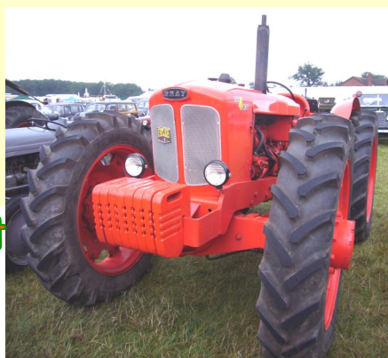
Right: a Bray tractor