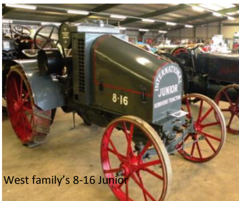
West family's 8-16 Junior