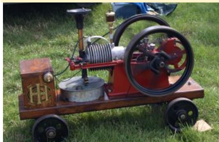
A Special Edition Wilescro model steamer owned by Charlie Calvery