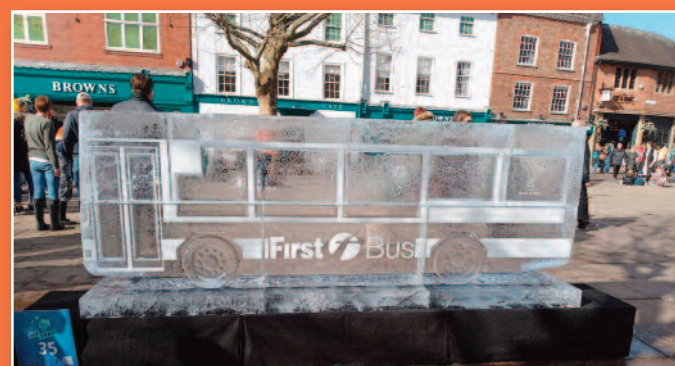
FIRST YORK PARK & RIDE