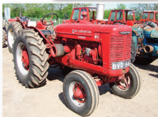
1945 McCormick W6, 4 cylinder petrol / paraffin