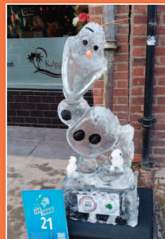
ANTARCTICA: OLAF (FROZEN)

The trail took you round the city following the map and each of the cities famous landmarks hosted one or more carvings, there were also live carvings held in St Sampson's Square where you could see the skill involved in producing these sculptures.