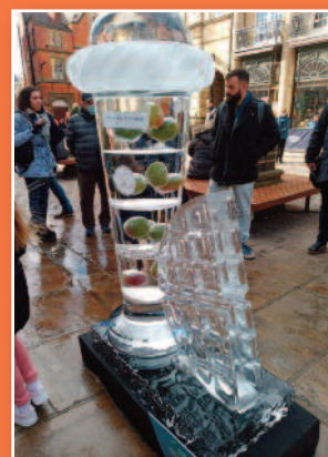
WAFFLES & ICE CREAM

It's the UK's biggest outdoor Ice Trail, with a range of magnificent ice sculptures transforming York's city centre.