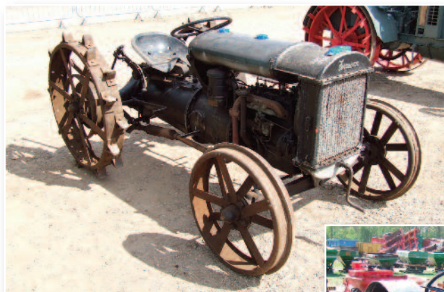
Ferguson Brown No. 278, thought to have come from the Wiston area originally

On the 22nd and 23rd April the Vintage Sale took place at Cheffins Sutton Sale Ground with on site and internet bidding. There were so many entries the sale was conducted over two days for the first time, perhaps not a full success as the number of bidders was very low in the first day, I believe reflecting in the prices raised.