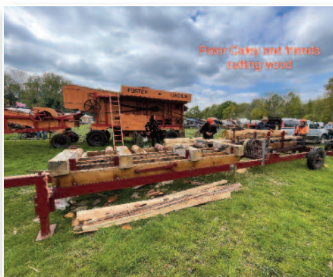
Peter Caley and friends testing wood

The Zetor Crystal 8011 80HP was launched in 1969, the Crystal was very advanced and featured a flat floor cab with air seat and heater. Independent hydraulics with low link sensing, independent 2-speed PTO, power steering and 2-speed gear splitter and all for just £4,850.00 in 1969.