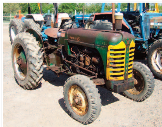
Oliver Super 55, 4 cylinder diesel