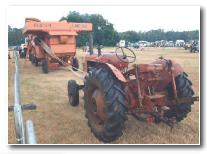
Tractors on Parade.