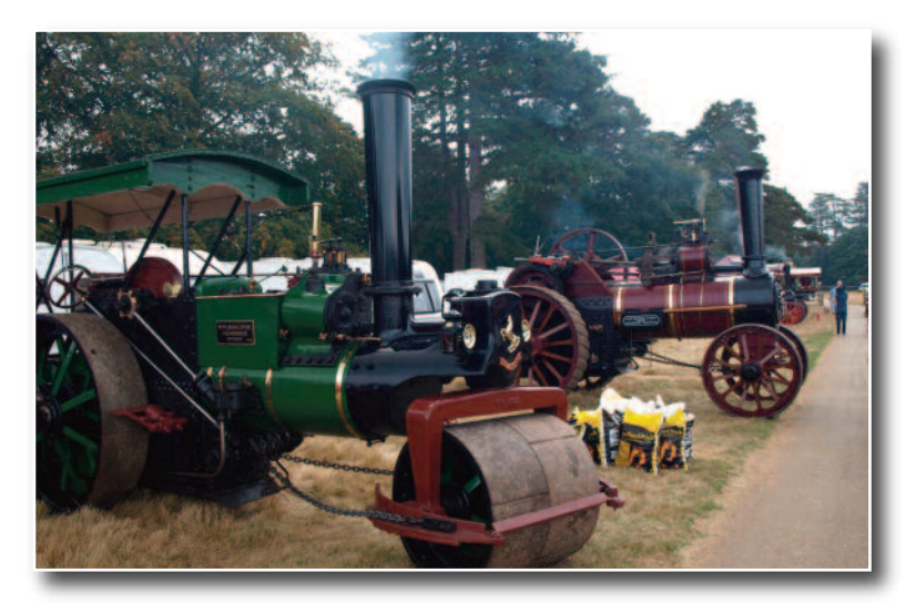
Lynn and Ivan Smith's "Invictus" a 120 year old 8 ton Aveling & Porter Road Roller no: 4877. I of only 6 made particularly for working on narrow streets and pavements. Ivan is pleased to brush of the cobwebs and get showing again.