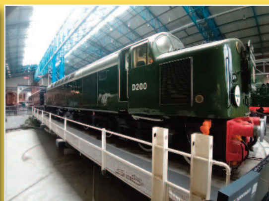
Pride of place on the turn table

The original museum buildings have been closed for refurbishment and as many exhibits as possible have been moved to the purpose built new building on the opposite side of the road, this has made the exhibits slightly more cramped than usual.