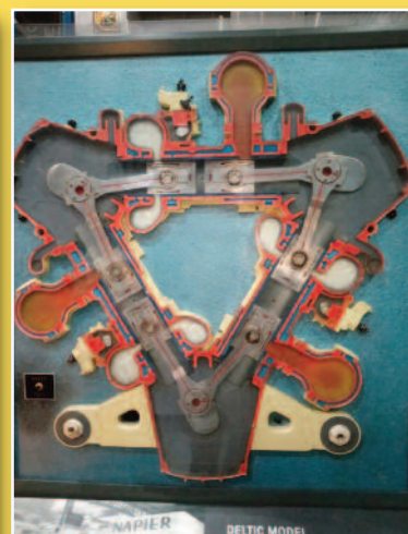
Sectional view of Deltic Engine