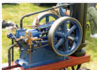
Gardner N-1 Spirit engine made in 1911