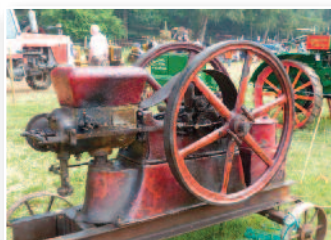
Amanco 6 HP made in 1913