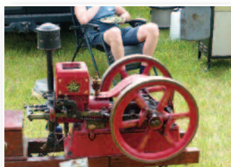
Acadia 2 HP Petrol made in the 1920's

Here we look at the over looked stationary engine section that I though was down from previous years.