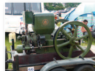
Ruston Hornsby 7 1/2 HP No. 122746 made in 1924

Big engines always catch attention, there were one or two on show but mostly the engines were in the smaller and more handleable 1 to 4 horse power. Some that took my eye were :-