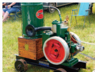
Hamworthy 4HP Patent Oil Engine, 2 stroke, Petrol/Paraffin made in 1931