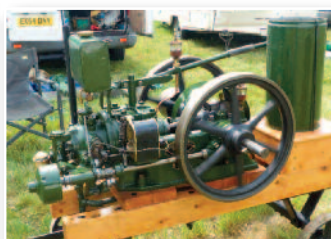
Ruston Hornsby 2HP No. 111223 made in 1923