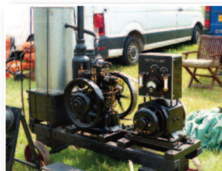
Petter Light 2 1/2 HP generating set made in 1921