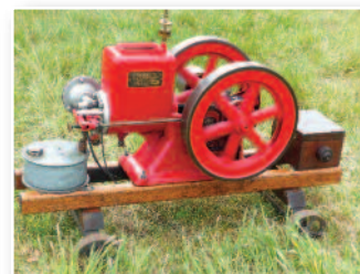
Perkins Windmill Co. from Miehawaka, Indiana, USA 3/4 HP made in 1916